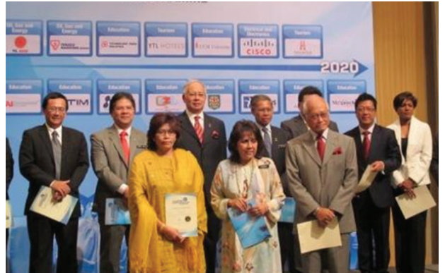
2011: SEGi at the launching of the Economic Transformation Programme (ETP), also in attendance was then-prime minister Dato Seri Najib Razak.