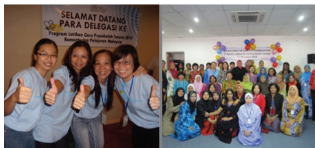
2010: Trained over 3000 private preschool teachers throughout Malaysia under the Ministry of Education Kursus Guru PraSekolah Swasta Project.